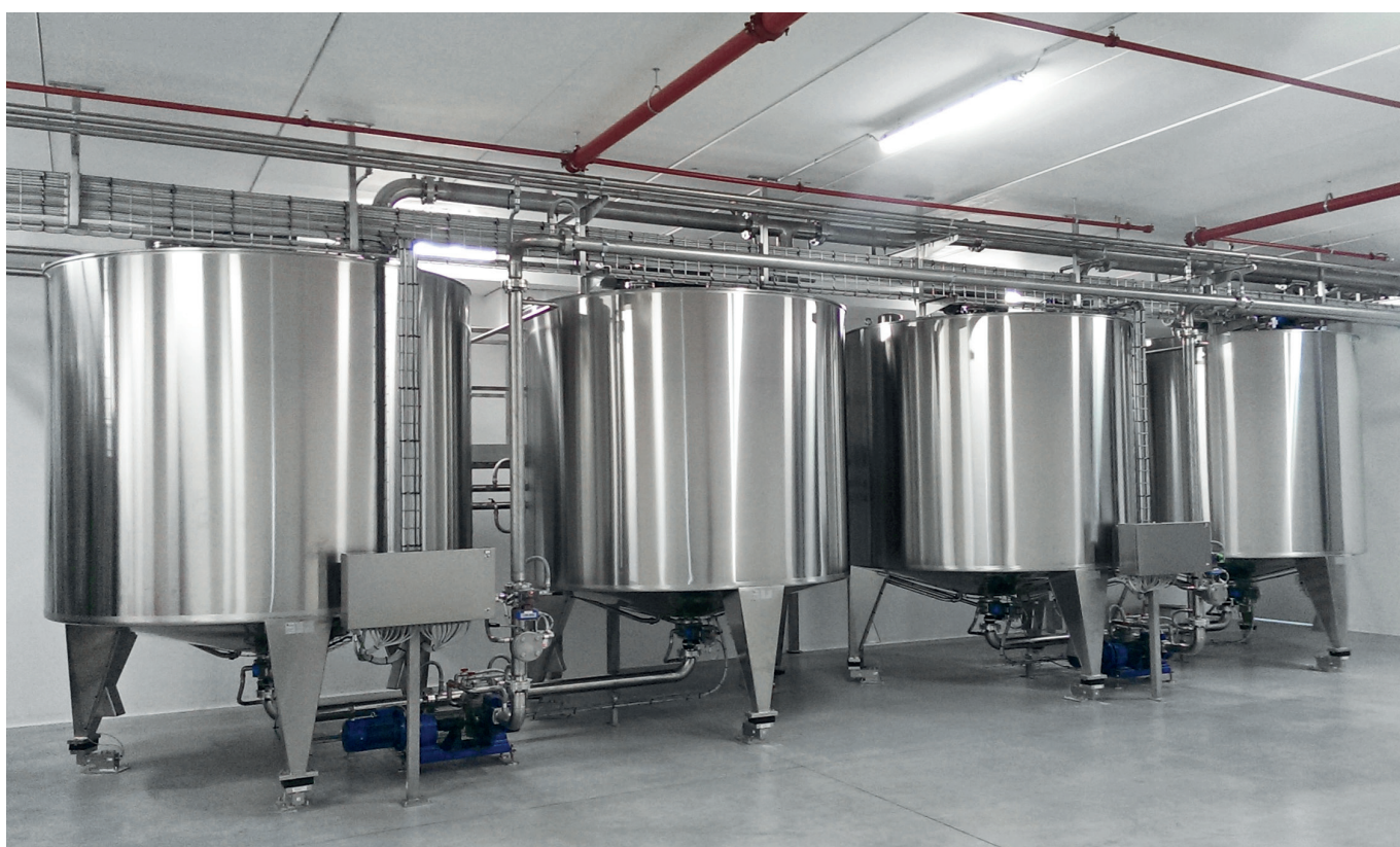
CHOCOLATE STORAGE PLANT